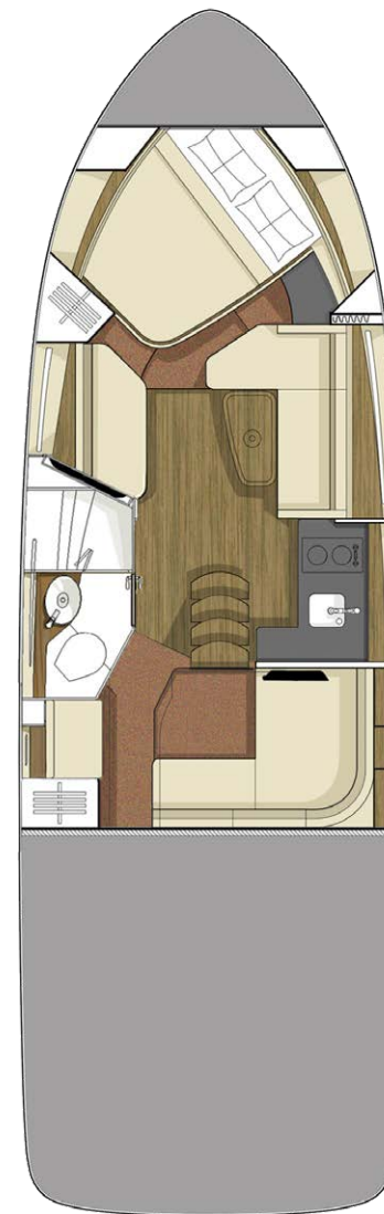
OPTIONAL CABIN LAYOUT

Shown with mid-berth 'L-shaped' seating (converts to sleeper)