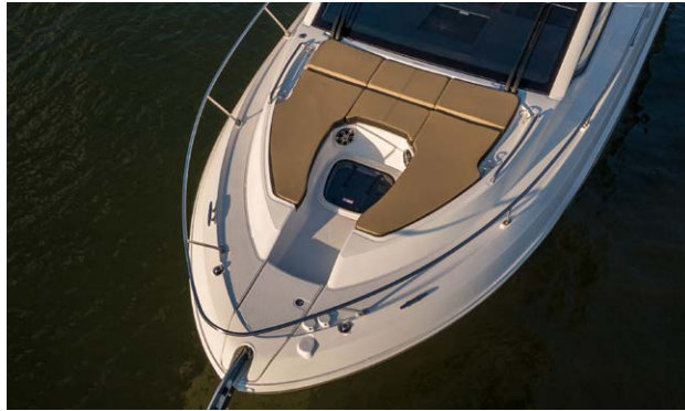
The Coupe foredeck features an enhanced bow seating configuration, adjustable & articulating backrest, cupholders and integral speakers.

Regardless of your destination, this spirited performer will get you there with enough class and fashionable flair to satisfy the most demanding guest. The 350 delivers refined luxury with a contoured Coupe fiberglass hardtop, ingenious Coupe foredeck seating, ample cockpit seating and amenities galore. The helm is designed to seamlessly integrate a range of standard and optional navigational gear, and eases control of the MerCruiser® engines or the optional Axis™ propulsion system.