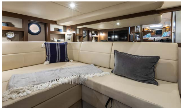
The luxurious, wood-trimmed mid-berth includes convertible twin beds that convert to a double berth with slide-out base & dedicated filler cushions. (Shown with optional mid-stateroom L-shaped seating layout.)