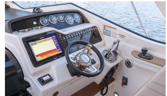
The well-designed, tiered helm station features standard Digital Dash with Mercury® VesselView Link Data with Simrad GO9 (9") Touchscreen Display & Chartplotter.