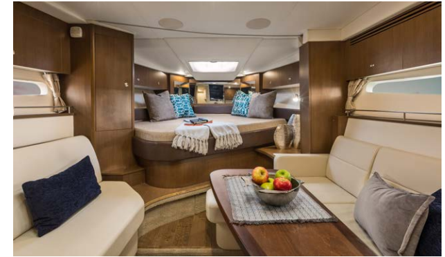
The 350's V-berth comes fully equipped so you can rest easy. The double bed is outfitted with neutral sheets as well as a luxurious memory-foam mattress.