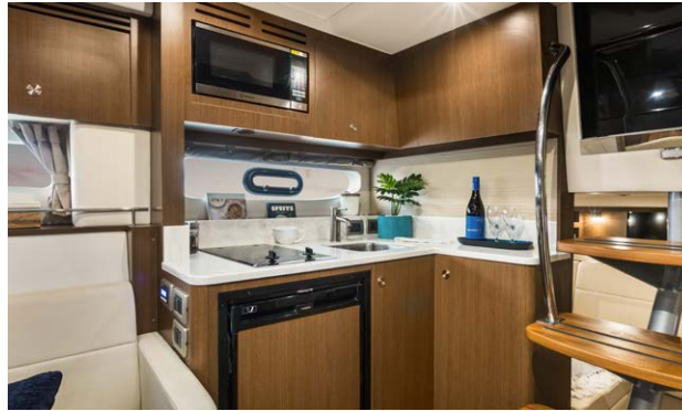
From the deluxe galley with ample storage to the solid-surface countertops and recessed stove, the Sundancer 350 Coupe is fit for a top chef.