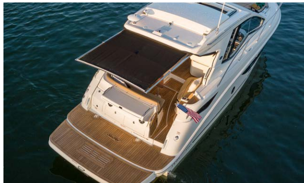
An optional cockpit retractable sunshade and transom Gourmet Station make for an inviting and comfortable social zone.