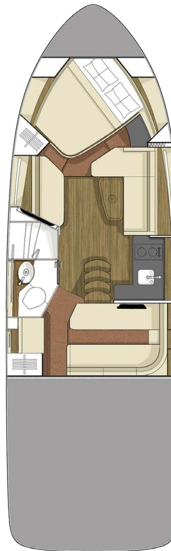
STANDARD CABIN LAYOUT