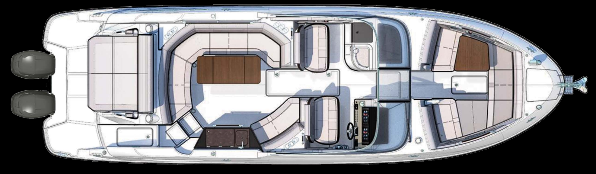
DECK / COCKPIT